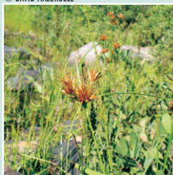
Growing along the lakeshore